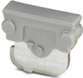
Feed-through connector, length: 10.5 mm, width: 4 mm, color: gray

Please be informed that the data shown in this PDF Document is generated from our Online Catalog. Please find the complete data in the user's documentation. Our General Terms of Use for Downloads are valid ( http://phoenixcontact.com/download )